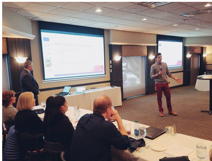
CEO Internship Program Student sharing his experience with the BAC members.